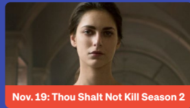
Nov. 19: Thou Shalt Not Kill Season 2

Unlock your NEPM Passport benefit at nepm.org . Get extended access to 1,500+ PBS episodes.