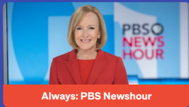
Always: PBS Newshour