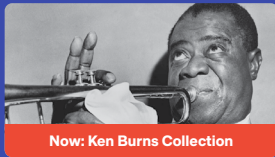
Now: Ken Burns Collection