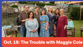
Oct. 18: The Trouble with Maggie Cole